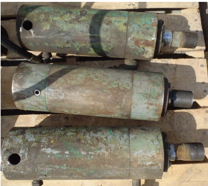
(3) Used Pines #4 clamp cylinder Original OEM cylinder Price: $225 each