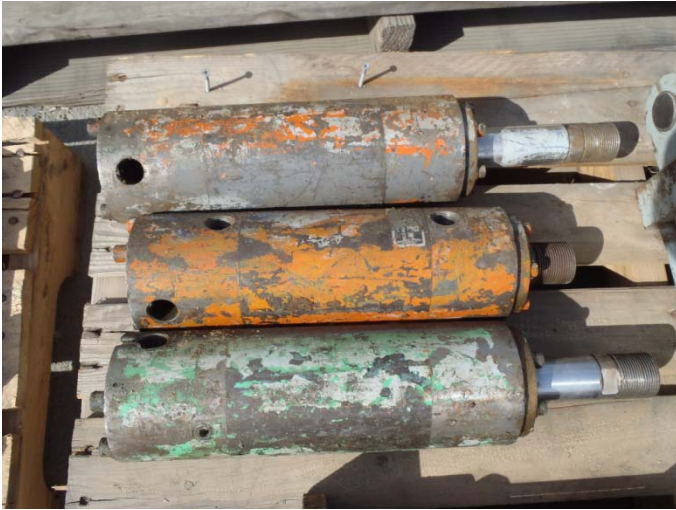
(3) Used Pines #2 clamp cylinder Original OEM cylinder Price: $125 each