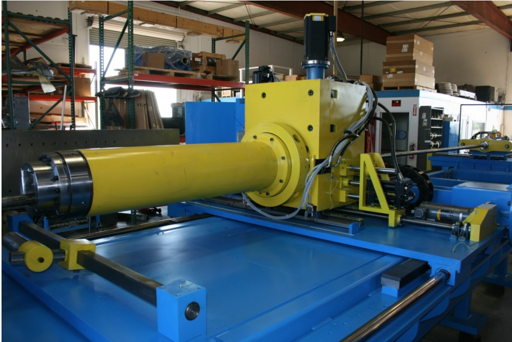
Large Force Capacity Collet Indexing System