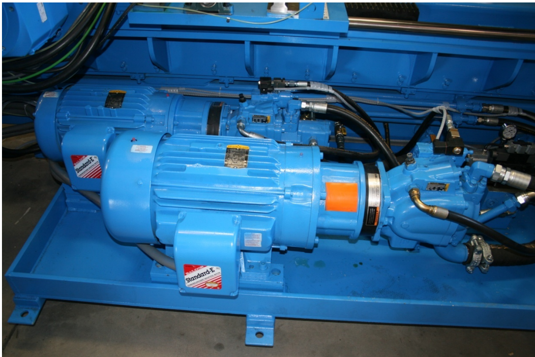
50 hp main hydraulic drive & 30hp independent PDA